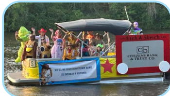
The Boat Parade Winner: "We'll be your hometown bank to infinity and beyond!"