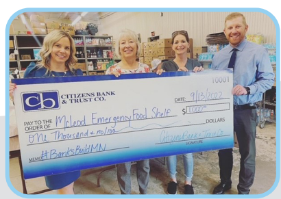
Food Drive Check

As part of the Minnesota Bankers Association Community Impact project, Cititzens Bank organized a "Stuff the Truck" food drive in September, and received 493 pounds of food in one day! Customers and staff also donated $150 in cash in addition to the Bank donating $1,000 to the local Food Shelf.