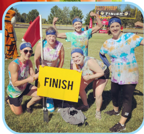
Tiger Time Challenge

The week was full of fun activities with Community Day, Tiger Time Challenge and the Grande Day Parade. There were also fireworks on Thursday and Sunday evening sponsored by CB&T. We participated in the boat parade Thursday evening with our float "Banking Through the Decades," as we are celebrating our 135th anniversary this year!